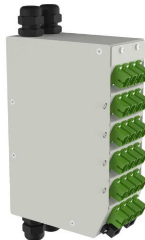
View of FDM Module with 24x SCA SX and 2x MTP adapters