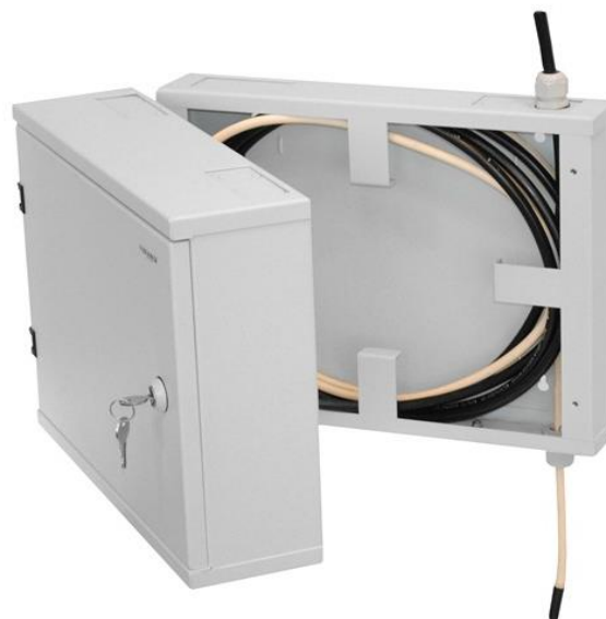
Optional cable reserve frame mounted on the rear part of the cabinet