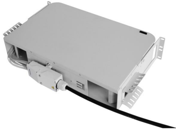
View of cable tube divider installed on PSR-A0-02 rotational patch panel