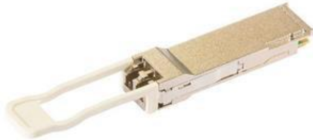
Picture 1 Transceiver QSFP28 100G 20km

QSFP28 100GBase-LR1, ELM laser/PIN receiver, BiDi, SMF, 20km