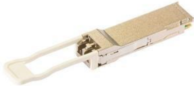
Picture 1 Transceiver QSFP28 100G 40km

QSFP28 100GBase-ER1, ELM laser/APD receiver, BiDi, SMF, 40km